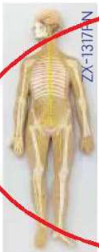
ZX-1317PN Nervous System Model PVC