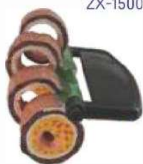
ZX-1500 Blocked Artery Model