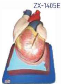
ZX-1405E Human Heart (7 Parts)