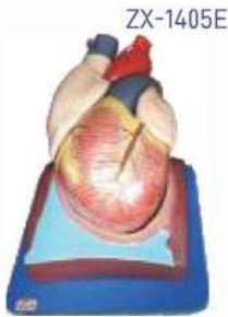
ZX-1405E Human Heart (7 Parts)