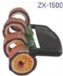
ZX-1500 Blocked Artery Model