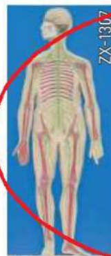
ZX-1307 Human Nervous System