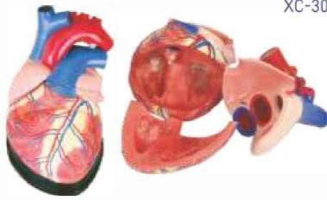
XC-307 Jumbo Heart Model