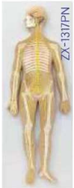
ZX-1317PN Nervous System Model PVC