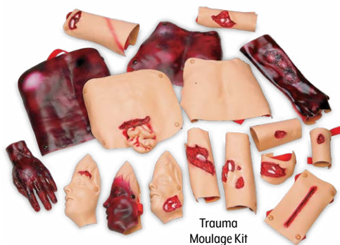
Trauma Moulage Kit