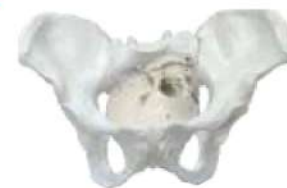
Birth Demonstration Model