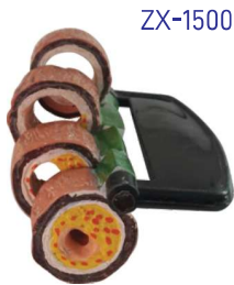
ZX-1500 Blocked Artery Model