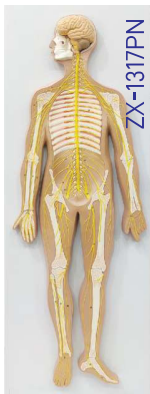
ZX-1317PN Nervous System Model PVC