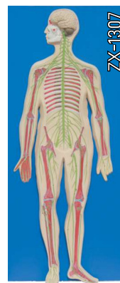
ZX-1307 Human Nervous System