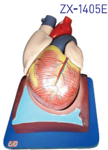
ZX-1405E Human Heart (7 Parts)