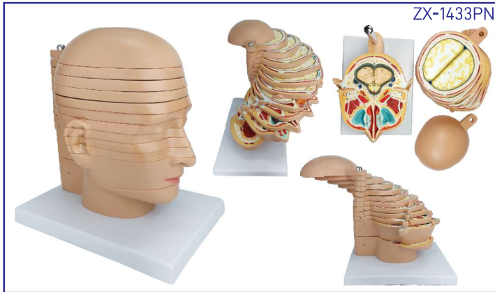
ZX-1433PN Sliced Head Model, 12 Slices