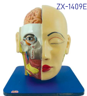
ZX-1409E Head, Brain and Eye