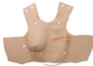
325-00650 Mastectomy Module