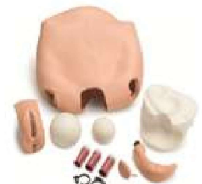
325-00450 Fundus Skills and Assessment Module