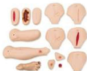
325-00550 Wound Care Assessment Set - Female