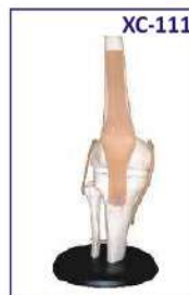
XC-111 Knee Joint