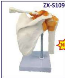
ZX-S109 Shoulder Joint Model Flexible