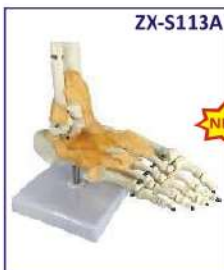
ZX-S113A Foot Joint Model Flexible