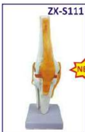
ZX-S111 Knee Joint Model Flexible