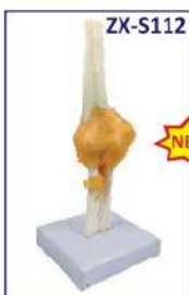
ZX-S112 Elbow Joint Model Flexible