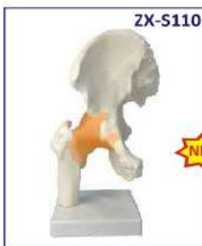
ZX-S110 Hip Joint Model Flexible