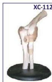
XC-112 Elbow Joint