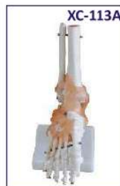
XC-113A Life-Size Foot Joint with Ligaments