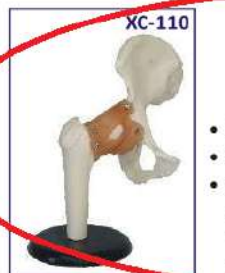
XC-110 Hip Joint