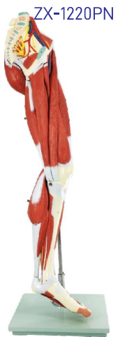
ZX-1220PN Muscular Leg Model 13 parts