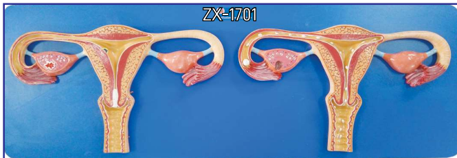
ZX-1701 Fertilization Process Simulator