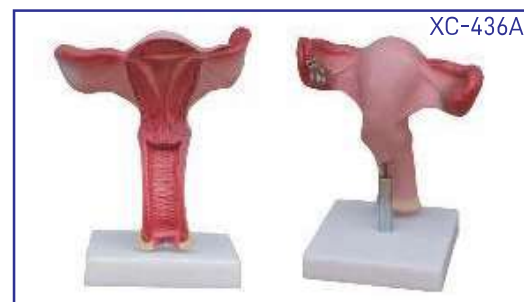
XC-436A Magnified Uterus Model

With the coronal section, this model shows: