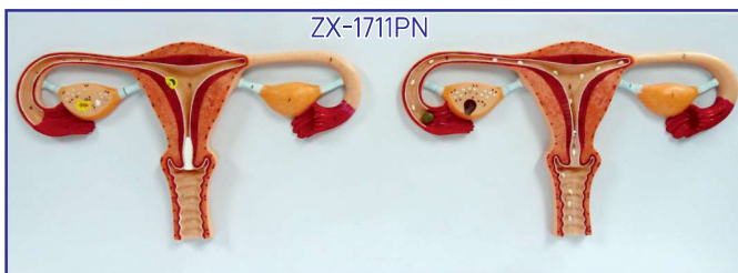
ZX-1711PN Fertilization Process Model PVC