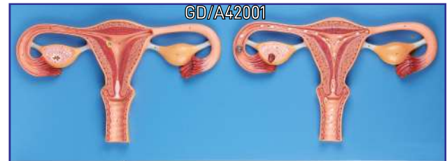
GD/A42001 Fertilization Process Simulator PVC