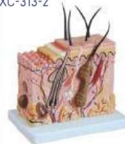
XC-313-2 Skin Block Model