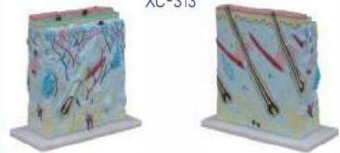
XC-313 Skin Model Enlarged