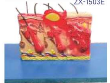
ZX-1503E Skin Burn