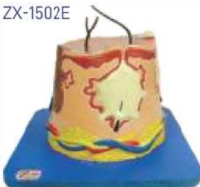
ZX-1502E Skin Acne