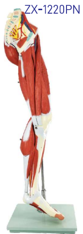
ZX-1220PN Muscular Leg Model 13 parts