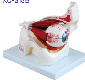
XC-316B Eye with Orbit