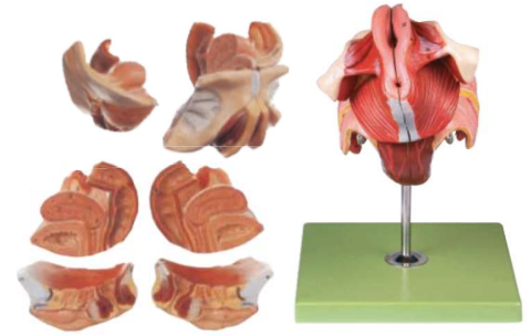
GD/A15105 Female Genital Organs