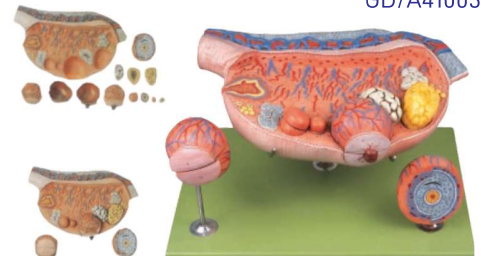
GD/A41003 Ovary Model