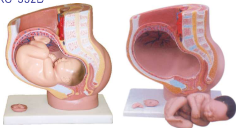
XC-332B Human Female Pelvis Section (4 parts)