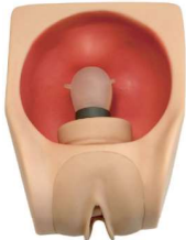
GD/F9B Female Contraception Practice Simulator