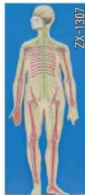
ZX-1307 Human Nervous System