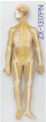
ZX-1317PN Nervous System Model PVC