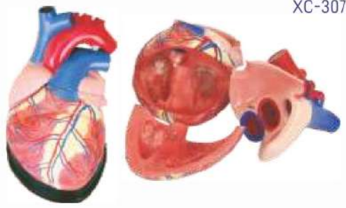
XC-307 Jumbo Heart Model