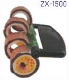
ZX-1500 Blocked Artery Model