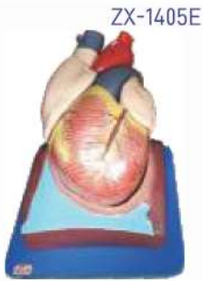
ZX-1405E Human Heart (7 Parts)