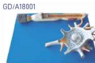
GD/A18001 Neuron Model