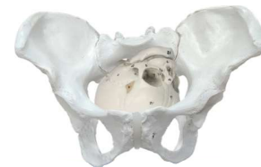
ZX-S127 Birth Demonstration Model