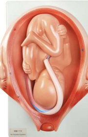
ZX-1710 Gestation Month Seventh