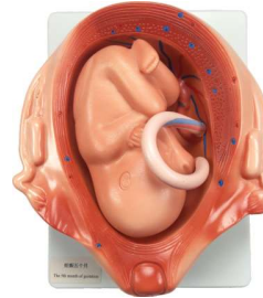
ZX-1709 Gestation Month Fifth