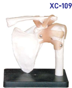
XC-109 Shoulder Joint