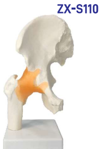
ZX-S110 Hip Joint Model Flexible