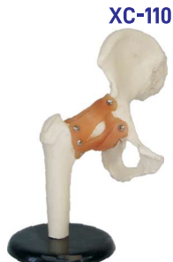
XC-110 Hip Joint