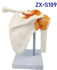
ZX-S109 Shoulder Joint Model Flexible