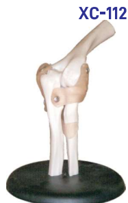
XC-112 Elbow Joint