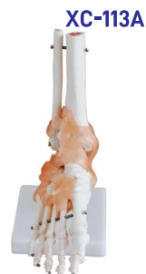
XC-113A Life-Size Foot Joint with Ligaments