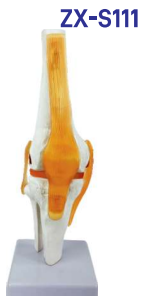
ZX-S111 Knee Joint Model Flexible