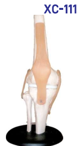
XC-111 Knee Joint