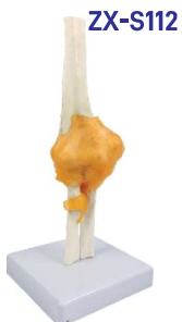
ZX-S112 Elbow Joint Model Flexible